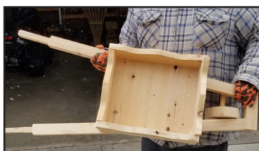
Small Wheelborrow - $30