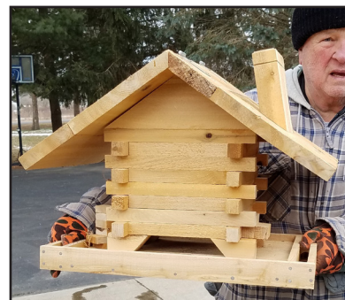
Log Cabin Bird Feeder - $45