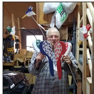
Bobbing Head Bird - $20