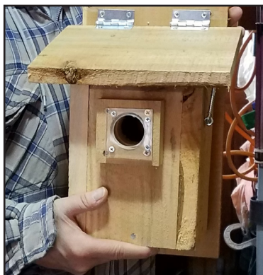
Blue Bird House - $15