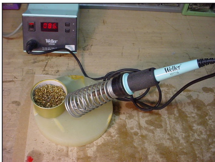
Soldering station and "tip cleaner"