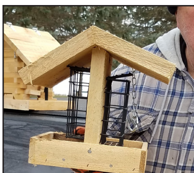
Suet Feeder - $15