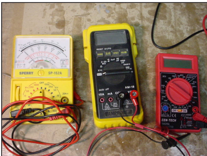
3 Types of VOM

Most of the measurements I make are GO No GO anyway. Is there voltage? Is there continuity? Simple tests can often find simple fixes. (like broken switches or burnt fuses.)