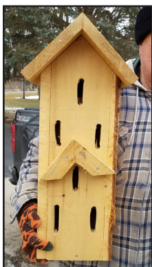
Butterfly House - $20