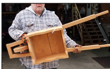
Large Wheelborrow - $35