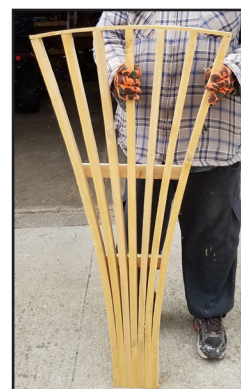
Trellis - $20