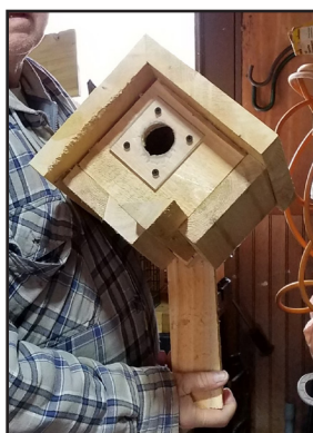
Regular Bird House - $15