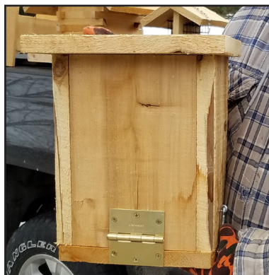
Bat House - $15

100% of the proceeds will benefit LCDRA (Lansing Civil Defense Repeater Association)