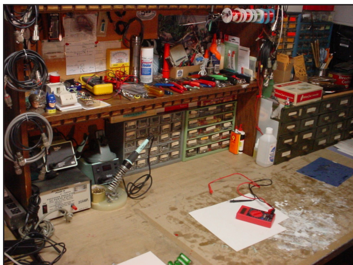
Here is my "bench" at home. Hand tools on the shelf, pwr supply, and soldering station on the left. Drawers for parts and components on the right. Various cables and patch cords are handy.

Test Equipment for the bench is next. First up is a VOM. (volt-ohm meter). I have several of these in various places in the home. I have digital versions as well as an older analog one. You don't have to get an expensive one. The "cheapies" at Harbor Freight work quite well.