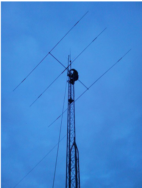
Tom/WA8WPI up on the tower