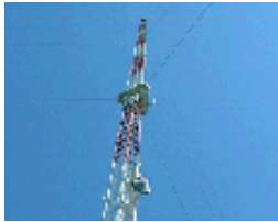
Lansing Civil Defense Repeater Association

Please print and complete the form below. Make check or money order payable to L.C.D.R.A.. Mail completed membership form and the membership fee to: