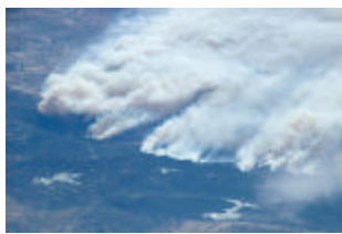
California burning: The California fires as viewed from the International Space Station on October 26. Lake Arrowhead is visible in this view.

Statewide, authorities report 11 separate fires and at least 13 dead. Gov Gray Davis has declared states of emergency in four counties.