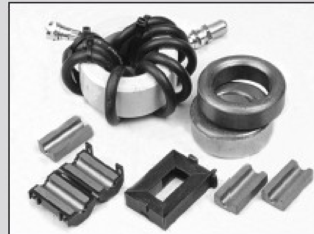
Figure 9.4 — Ferrite is a ceramic magnetic material used to make choke filters for RFI suppression. It is available in many different forms: rings (toroids), rods, and beads. Cables can be passed through or wound on these cores to prevent RF signals from flowing along their outside surfaces.

Ferrite is available as round cores (toroids), rods and beads shown in Figure 9.4 . Wires or cables are then wound on or passed through the ferrite forms. Beads are made large enough that they can be slipped over coaxial cables and secured with tape or a locking wire-tie. A wire or cable wound on such a ferrite core forms an RF choke.