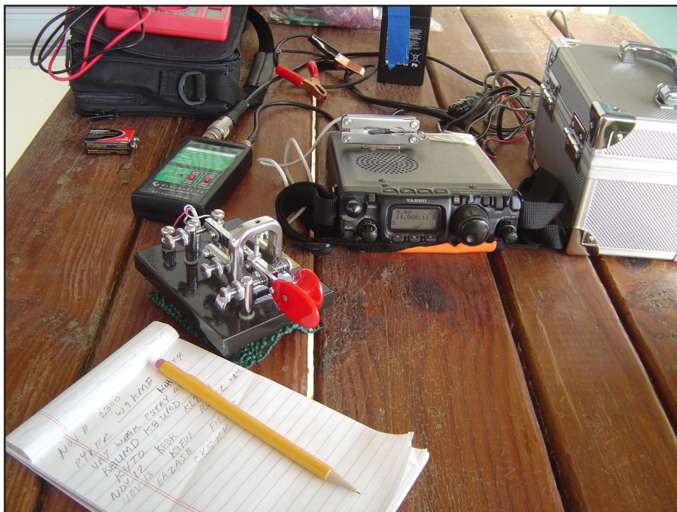
THE HOLIDAY STYLE SETUP.

At the start of the sprint 20M was dead. 40M was noisy yet quite a few peanut whistles were heard calling CQ NA. I managed 7 QSO's in a