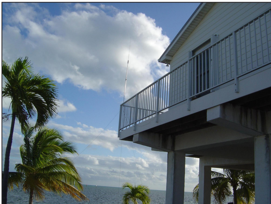
THE FIRST LOCATION OF THE VERTICAL, LOOKING TOWARDS CUBA TO THE SOUTH.

After a couple days of settling in, I broke out the antenna gear and proceeded with the aerial setup. I clamped the antenna mount on to the railing that runs around the back porch and connected the 4 radials. Then I assembled the vertical element and fastened it down “hand tight” for easy take down. The radials were stretched out below and run right to the edge of the salt water. I had clear ocean view on 3 sides, with a straight shot to Cuba to the south, Africa to the east, and Texas to the west. As I unrolled the coax to make the connection to the rig, I had visions of world-wide DX awaiting! I hastily pulled out the rig and connected the plug to the back. The speaker “jumped” to life as the power switch was pressed, and I was