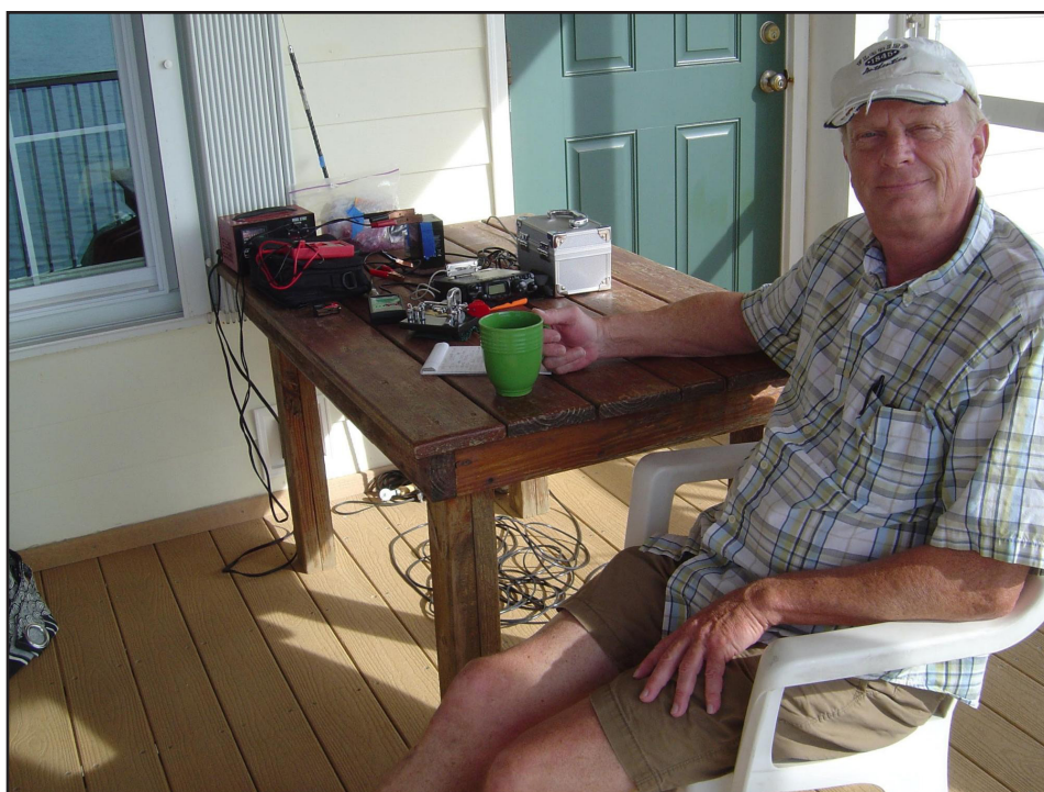
RELAXING WITH A CUP OF JAVA.

Naturally the Ham gear went along too. Over the years, I have put together a small ditty bag that has all the necessities for getting on the air. This includes a Yaesu FT-817 xcvr, key, Elecraft T1 QRP tuner, coax, cables, and a spare gel-cell battery. Also included in the bag are several nuts and bolts, screws of various sizes, spare fuses, some nylon twine, paper and pencil, coax jumpers, and a few BNC to PL259