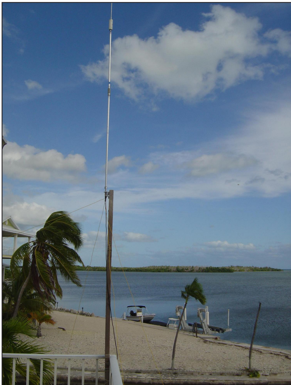
MODIFIED 2X4 MOUNT LOOKING EAST TOWARDS AFRICA

From experience, that many times I can get a vertical to "play better" simply by moving it a bit, or raising the feed point up a few more feet. I unbolted the CB mount and re-attached it to an old 2 by 4 that I found in the shed. The vertical was