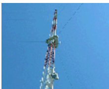
Lansing Civil Defense Repeater Association

As a licensed Amateur, you can sign up today as a Full member of CMARC. This grants you voting rights and an annual subscription to SCOPE, the club newsletter. An Associate member does not have voting rights but does receive an annual subscription to the SCOPE.