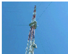
Lansing Civil Defense Repeater Association

Please print and complete the form below. Make check or money order payable to L.C.D.R.A.. Mail completed membership form and the membership fee to: