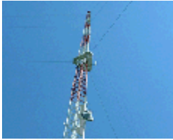
Lansing Civil Defense Repeater Association

Please print and complete the form below. Make check or money order payable to L.C.D.R.A.. Mail completed membership form and the membership fee to: