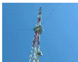
Lansing Civil Defense Repeater Association

Please print and complete the form below. Make check or money order payable to L.C.D.R.A.. Mail completed membership form and the membership fee to: