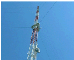
Lansing Civil Defense Repeater Association

Please print and complete the form below. Make check or money order payable to L.C.D.R.A.. Mail completed membership form and the membership fee to: