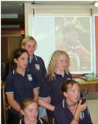
One Renmark student asks her question of Foale while others queue up awaiting their turn at the microphone. A photo of Foale is visible on a projection screen behind them.

"People should be living on the moon in another 10 years," Foale told the youngsters, and I hope some of them will be you." Foale and Russian cosmonaut Alex "Sasha" Kaleri, U8MIR, have been aboard the ISS for about one month. Foale said he's already a bit homesick, and he expects that to get worse after the Christmas holiday.